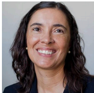
Anita Earls NC Supreme Court