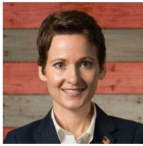
Ginger Garner NC Senate, District 2